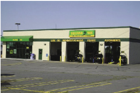
Sullivan Tire at the Fairhaven Plaza

Sea Watch Realty specializes in commercial real estate and has four offices located in Marion, Plymouth Falmouth and Hyannis.