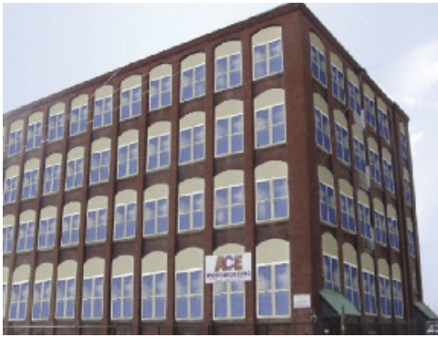
79 Brook Street, New Bedford, MA

Sea Watch Realty, Inc. sold the 83,000 s/f 4-story mill building located at 79 Brook St. The building known as the Ace Wood Working, Cozy Closets building was sold to 79 Brook St., LLC for $625,000. Noble Vincent of Sea Watch Realty listed the property for sale and brokered the transaction between the seller, RVB Realty Trust, Inc., and the buyer, Rattan Furniture, Inc. The property was first marketed for sale at the end of March and closed in three months.